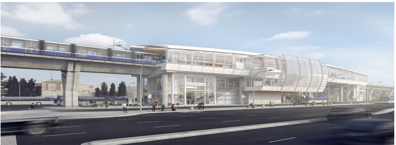
Future West Edmonton Mall LRT Station and transit centre