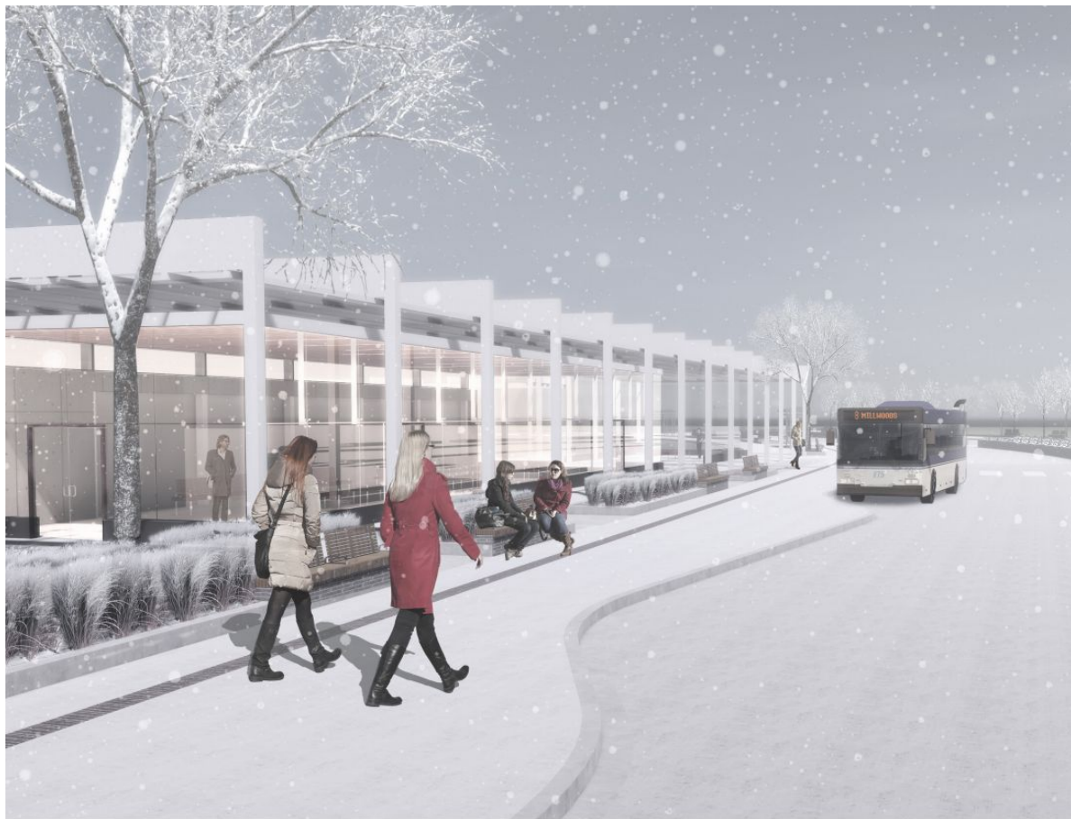
Draft artist rendering looking east past the transit centre building- subject to change