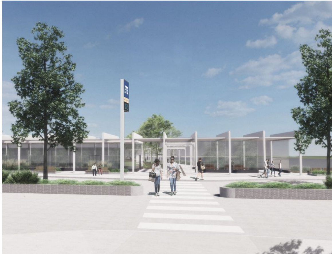
Draft artist rendering of south side of transit loop looking north towards transit centre- subject to change