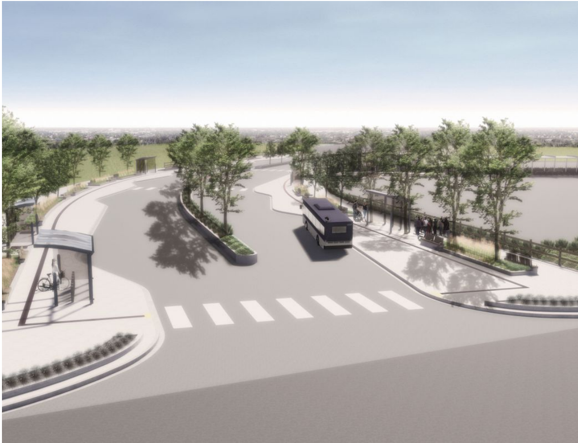
Draft artist rendering looking west at the east entrance to the transit centre- subject to change