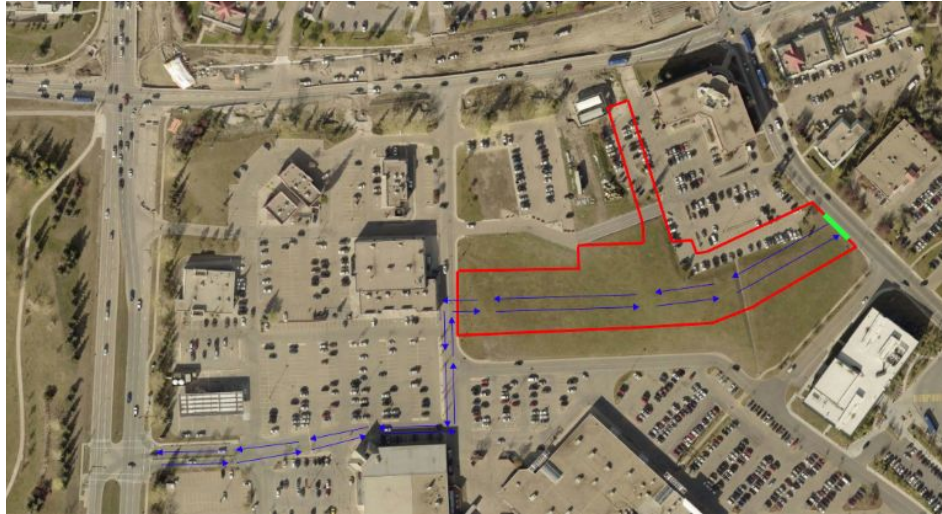
Aerial view of bus route access- subject to change

These routes were developed in coordination with ETS to ensure timely and efficient bus service.