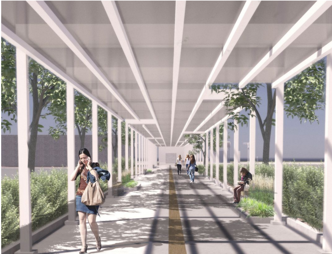
Draft artist rendering from under the covered walkway looking north- subject to change