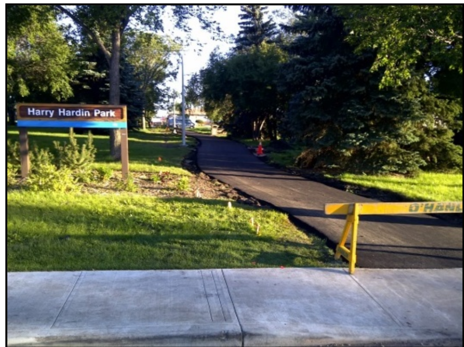
Neighbourhood Park in Fulton Place AFTER