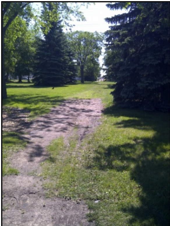
Neighbourhood Park in Fulton Place BEFORE