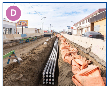
Area 4: Ductbank work along Stony Plain Road