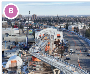
Area 6: West Edmonton Mall Station & Elevated Guideway