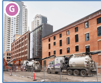
Area 1: Construction along 102 Avenue