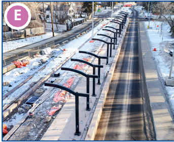
Area 3: Glenora Stop construction