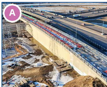
Area 7: Anthony Henday Drive bridge LRV barrier work

Manufacturing, static testing, and shipping activities continue in Korea. The delivery of LRVs to Edmonton was on hold due to transport issues.