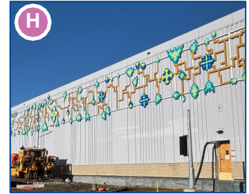
Area 9: Art installation at Gerry Wright OMF-B