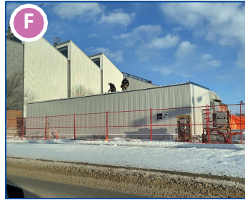
Area 2: UC auxiliary building construction along 104 Avenue