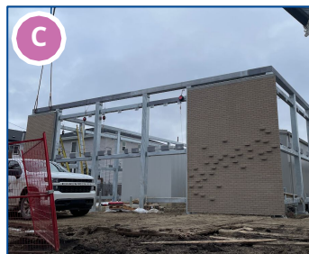
Area 5: UC perimeter screening wall installation