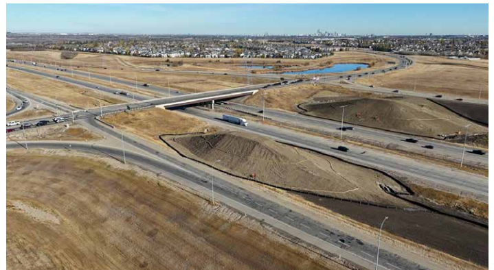
Stage Three site preparation 2025

Stage Three is funded by the Government of Alberta. Planning, design and delivery of the project is led by the City of Edmonton in partnership with Alberta Transportation and Economic Corridors.