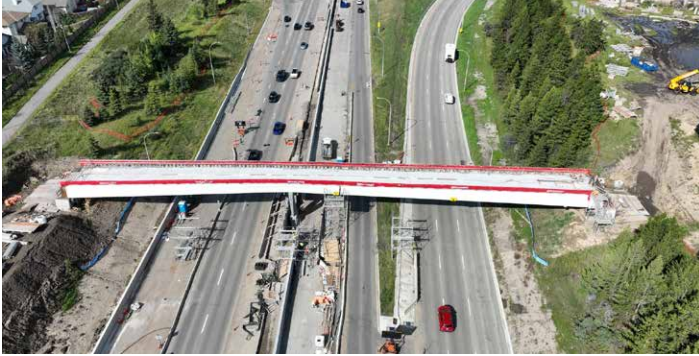
142 Street Pedestrian/ Cyclist Bridge Under Construction (looking West)