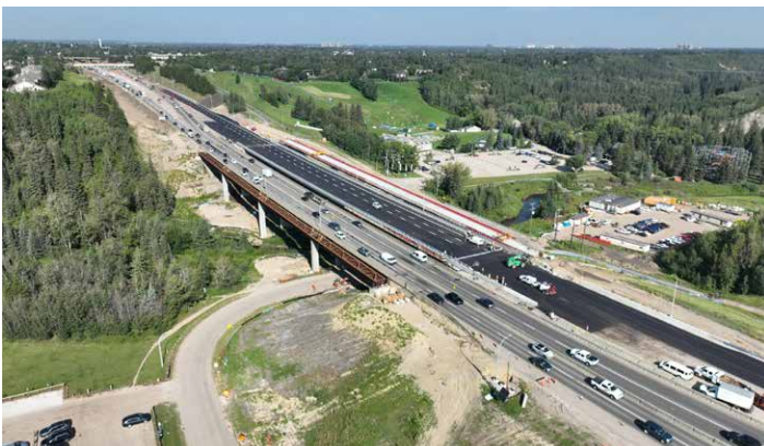
Rainbow Valley Bridges Under Construction, just prior to traffic flip to close the EB Bridge (looking Northwest)