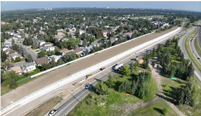
Bus-Only Lane & Mechanically Stabilized Earth Retaining Wall Under Construction (looking Northwest)