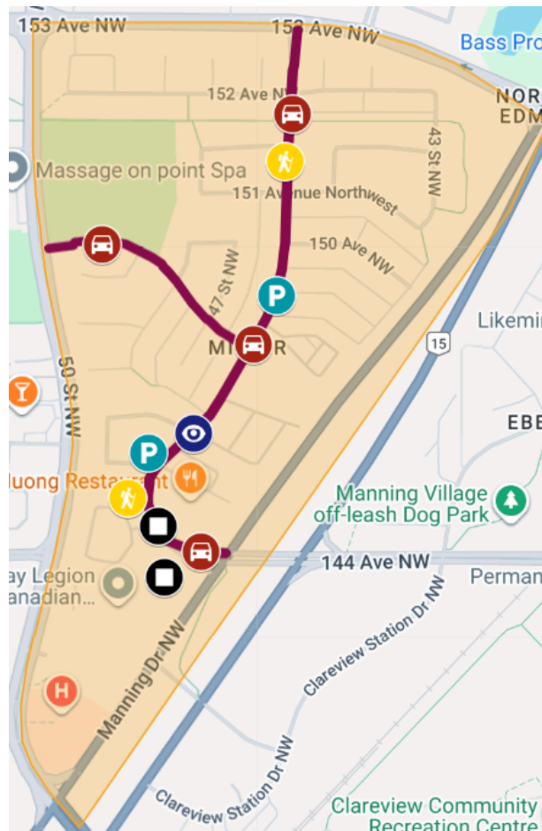
This map provides a visual summary of the top concerns received during the engagement activities in Miller.

A visual overview of all engagement data can be found in the 2025 Miller Street Lab Engagement Map . The map has two layers; one provides an overview of all traffic safety concerns identified during the engagement period, while the other - the summary layer - identifies areas in the neighbourhood where the highest volume of major concerns were noted.