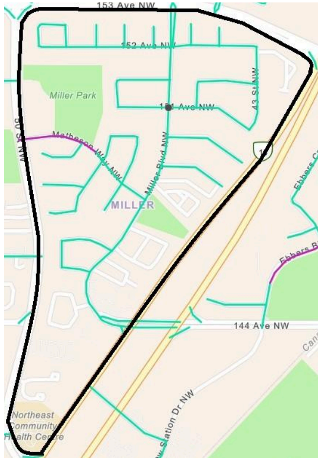
Map Legend: Roads In Project Scope