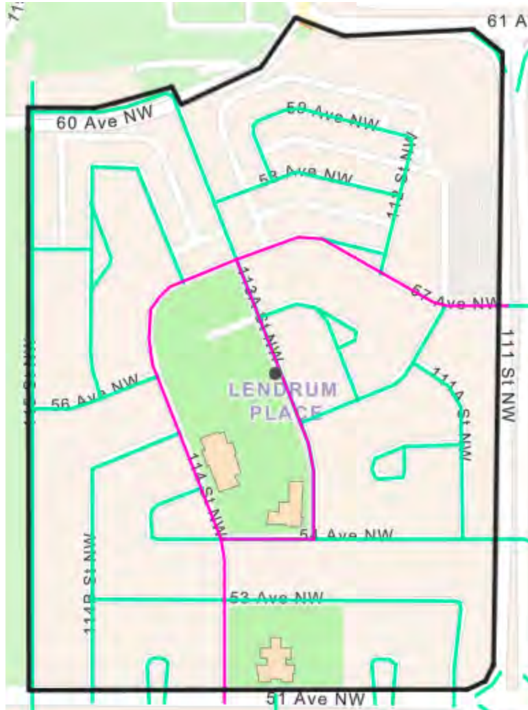
Map Legend: Roads In Project Scope