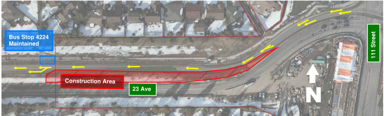
Map 3: 23 Avenue Eastbound Right Lane Closure