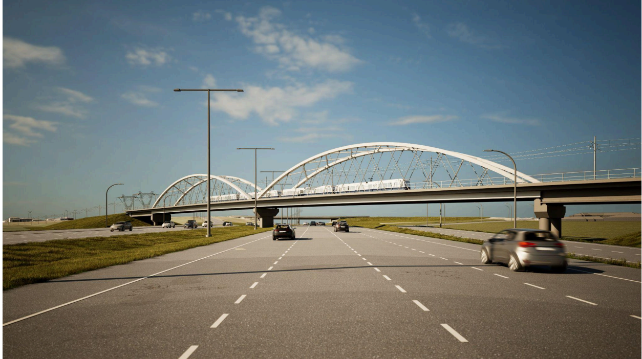
Anthony Henday Drive LRT Bridge (looking west)