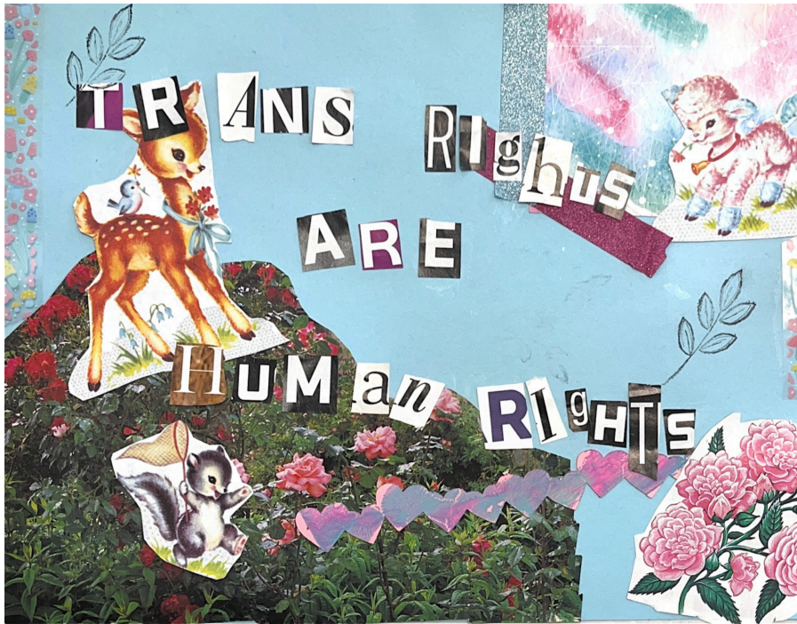
Okimaw kihêw mêkwanak hosted a collage-making workshop as part of their “Host Your Own Conversation” in 2025. The image featured here is one participant’s response to the question: “Imagine Edmonton in 10 years - what do inclusive city services, programs, spaces, and places look and feel like for 2SLGBTQIA+ people?”

This section outlines the Beyond Belonging: 2SLGBTQIA+ Safe Spaces Action Plan (“Action Plan”) that all departments of the City of Edmonton will carry out from 2026 until the end of 2029. It is organized into seven actions with 53 associated subactions. The Action Plan responds to the input of nearly 800 2SLGBTQIA+ Edmontonians engaged between February and June 2025 (see Appendix C). It is further informed by a detailed Community Insights document (see Appendix A) that includes input from additional 95 community members and 41 City of Edmonton staff engaged between November and December 2025, and a Jurisdictional Scan (see Appendix B). The draft Action Plan was developed in collaboration with all City departments, and includes existing and future actions that align with the priorities identified during public engagement. As such, these actions demonstrate direct connection to appropriate and accountable business areas. The plan was then aligned and confirmed with community members in the fall of 2025. This input has informed adjustments to the below Action Plan.