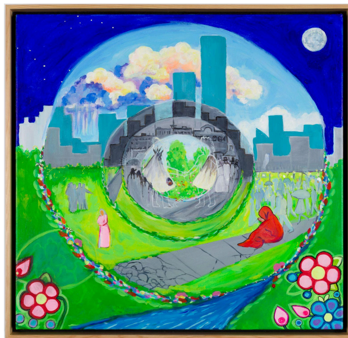
“pisiskapahtam” by Lana Whiskeyjack

Beyond Belonging: The 2SLGBTQIA+ Safe Spaces Action Plan is not the first nor only effort to confront hate against 2SLGBTQIA+ people on these lands. We honour the leadership, resistance and community-building of Indigenous, Two-Spirit and Indigiqueer people who have long advanced inclusion and safety. Their work provides essential frameworks for understanding what safety and belonging truly mean in Edmonton. We acknowledge the importance of naming the relationships between land, colonialism and inclusion. This project is a step forward on a path shaped by those who came before, and one that calls for continued care and commitment.