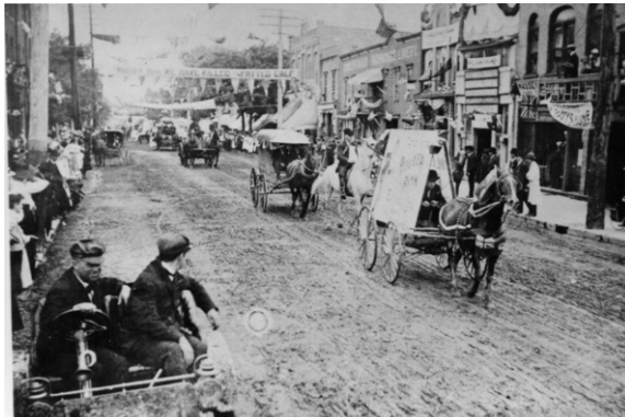
This 1920 parade was typical of public celebrations in early Edmonton.

As it winds through the Park, moving from one historical period to the next, the parade will feature notable citizens, ordinary families, unique characters and every mode of transport the City offered in the period up to the 1920s. A living, breathing timeline will unfold along historic streets, ending the day on a high note, full of life, energy and excitement.