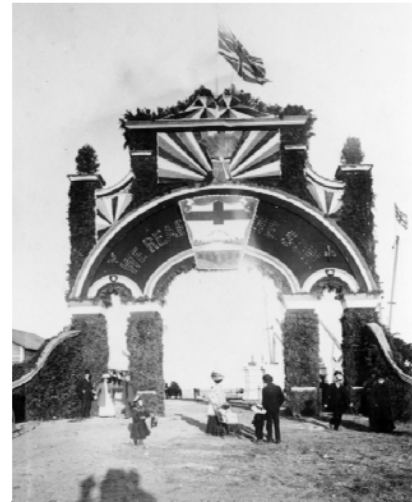
This ceremonial gate was constructed for the 1905 inauguration of Alberta.

Specific needs such as improved access to visitor services for people with mobility, vision, hearing and other physical concerns that can limit participation in the Fort Edmonton Park experience will be addressed with new facilities and programs.