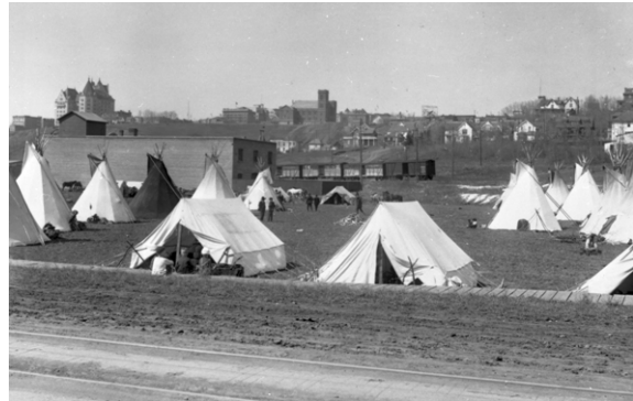
An Aboriginal encampment in Rossdale in 1919. Aboriginal people continued to be part of the Edmonton community after the closure of Fort Edmonton.

Spirit of the First Nations – Located in the heart of the expanded Aboriginal Cultural Centre's Village, Spirit of the First Nations, will be a stirring celebration of Canada's original inhabitants and their culture. New programming at this site, and throughout the Park, will offer a more complete picture of the role of Aboriginal people in the development of the region over the past 10,000 years. It will add an additional layer of cultural perspective to the Park, and give recognition to the significant Aboriginal population in the Edmonton area.