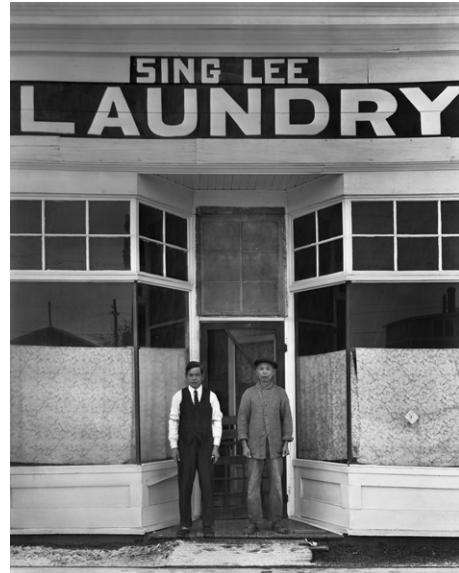
Sing Lee Laundry, 1932.

Sing Lee Laundry – The re-creation of the historic Sing Lee Laundry could tell the very specific story of the Chinese men who emigrated to Canada only to discover that immigration laws restricted their ability to bring their families with them and therefore consigning them to lifetimes of bachelorhood and exclusion from mainstream society. Despite their disadvantaged position many worked hard and established successful businesses and strong local community organizations and bonds. This is an area where the historium approach would be particularly suitable as a means of presenting this remarkable story of perseverance in the face of legal, social and economic obstacles. Significant consultation with the Chinese community would occur to ensure that this remarkable story is told with sensitivity and authenticity.