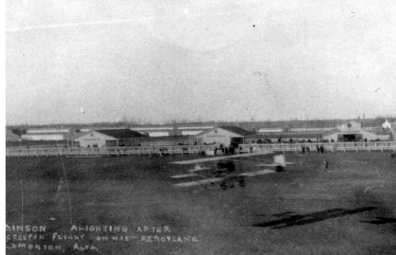
A flying demonstration at the Edmonton Exhibition Grounds, 1911.

Flexible design options would mean the Hangar would still be available to host evening events.