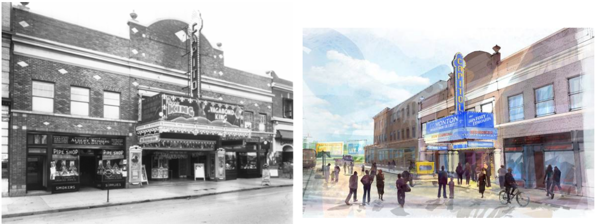
Capitol Theatre front elevation, 1930.

The reconstructed Capitol Theatre movie palace will house a captivating multi-media experience which will recount the history of Edmonton through the eyes of some of its most colourful characters. Starting with the area’s earliest inhabitants, it will offer a journey through time, celebrating Edmonton’s place and context in the world as it evolves from a regular meeting place for First Nations peoples to its “modern” incarnation.