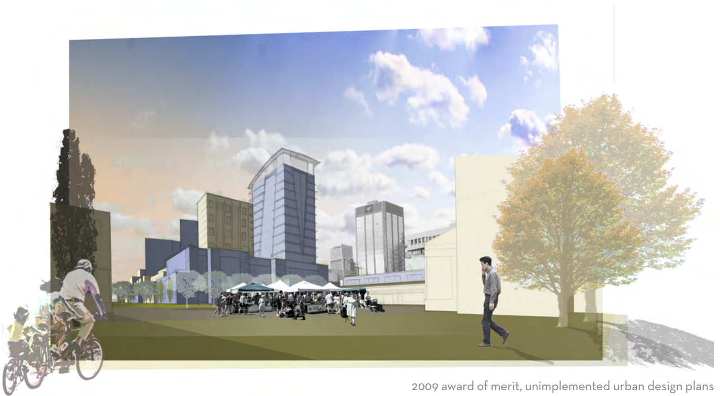
2009 award of merit, unimplemented urban design plans the quarters urban design plan

Urban Design and architectural excellence play an important role in enhancing the quality of life in Canadian cities. The City of Edmonton and the Royal Architectural Institute of Canada (RAIC) wish to promote a greater awareness of that role. For this reason, an Urban Design Awards program has been established to recognize individuals, organizations, firms and projects that have contributed to enhancing the quality of life in Edmonton. We invite you to participate in this celebration of excellence.