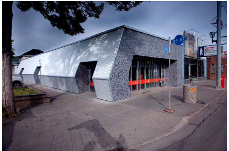
2009 award of merit, urban fragments 11805-94 street facade