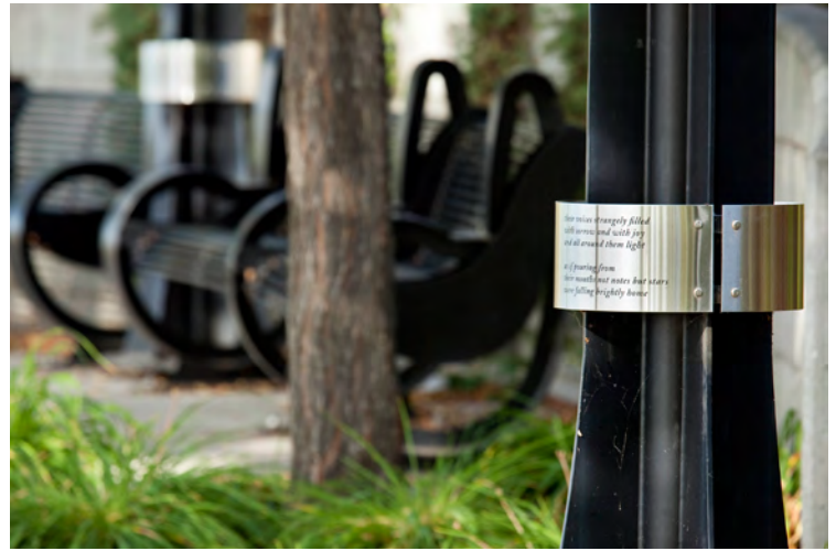
2009 award of merit, urban fragments poetry rings

Eligibility: The project must have been completed after January 1, 2005. Projects are not eligible for RAIC's national competition; awards will be pre-screened by the Awards Committee.