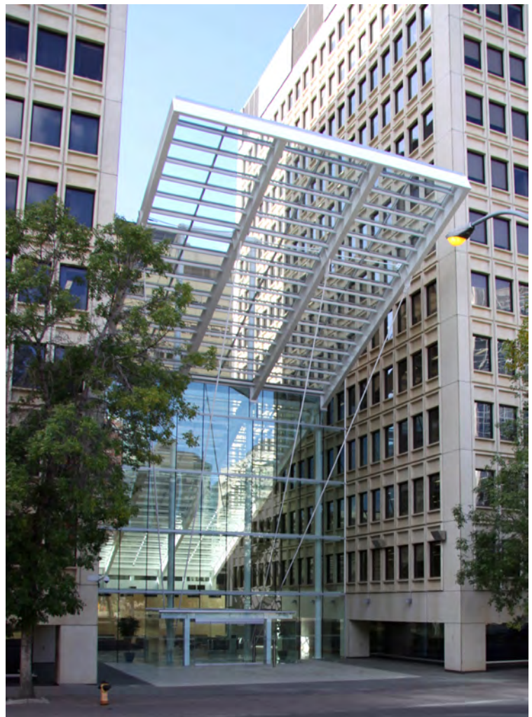
2009 award of excellence, urban architecture capital health centre

Eligibility: A new building, a renovated building, or complex of buildings completed or installed after January 1, 2005 within the City of Edmonton, and designed by an architect.