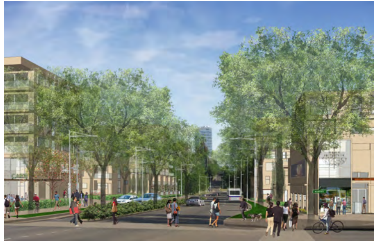
2009 award of excellence, unimplemented urban design plans west rossdale urban design plans

Eligibility: The plan or study must have been completed after January 1, 2005. However, it should not yet have been implemented.