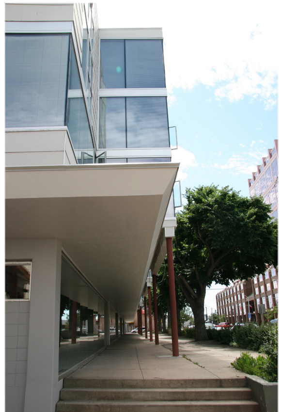
Award of Excellence | City Market Affordable Housing, Dub Architects

Eligibility: A new building, a renovated building, or complex of buildings completed or installed after January 1, 2003 within the City of Edmonton, and designed by an architect.