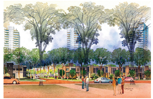
Award of Merit | Strathearn Heights Master Plan Owner | Rockwell Developments + Nearctic Development Corporation

Eligibility: The improvement must have been completed after January 1, 2003.