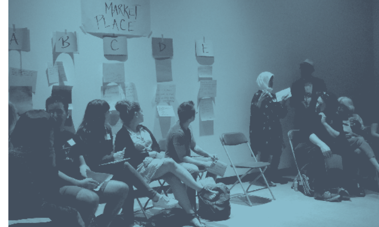
Equity workshop with ALIF Partners.

In order for the plan to be as accountable and optimized as possible over its 10-year lifespan, a MEL framework was developed not only to serve the plan over the next decade, but to ensure that the plan would be measurable from the outset, rather than waiting well into the plan to determine if it is working as effectively as possible. This holds the implementing organizations accountable to the public and stakeholders.