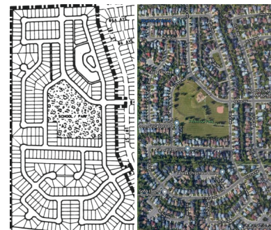
ABOVE LEFT Neighbourhood Structure Plan concept RIGHT Neighbourhood area as built out today.

The way the City approaches land use planning can also change over time. For example, many older plans are very detailed. Some give direction about the number, size, and location of bedrooms within a home, along with their orientation to amenity space. This level of detail no longer aligns with modern planning practice.