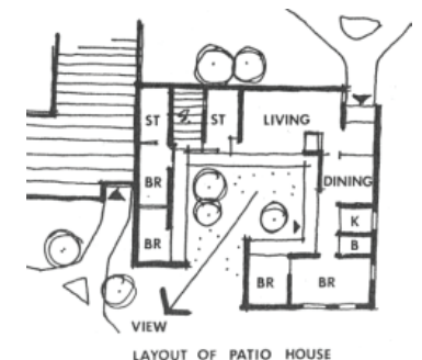
ABOVE This Outline Plan provides spatial planning for a unit. This level of detail does not follow modern planning practice.