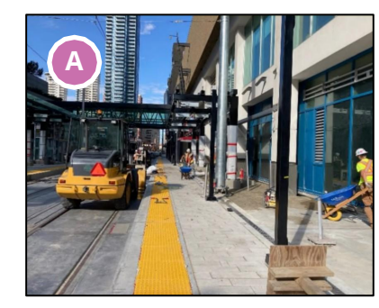
Area 1 - 102 Ave Streetscape

TransEd Work in Q3: TransEd crews continued to perform finishing works along the Valley Line trackway downtown. They completed landscaping at Churchill Square and continue to install streetscape pieces in the downtown area (Figure A). Crews have completed the construction of the Chinese structure over the north portal. They continued to install systems infrastructure in the tunnel—tunnel finishing is nearing completion and system testing is ongoing (Figure B). Crews continue to install Indigenous art on the Tawatinâ Bridge underslung shared-use path (Figure C). On the elevated guideway to the south of the river, crews continued to perform electrical work, including installing the wires for the overhead catenary system (OCS). The Muttart and Avonmore stops saw progress as crews installed ticket vending machines and signage (Figure D & E). Crews continued to install interior finishings and other systems infrastructure at Davies Station (Figure F). They continued rehabilitation work on the Whitemud Drive bridge. Crews continued internal and external finishing works at the Gerry Wright Operations and Maintenance Facility (OMF). They also worked on installing LRV signals along the 13-km route and are continuing testing and commissioning of the LRVs.