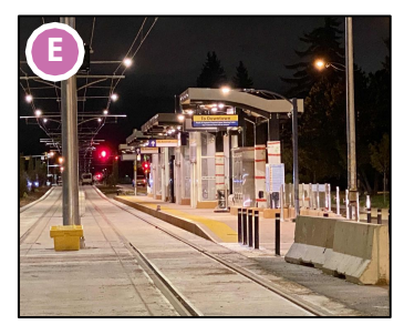
Area 4 - Avonmore Stop Signage