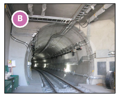
Area 2 - Southbound Tunnel Finishing