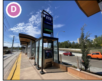
Area 3 - Muttart Stop Ticket Vending Machines & Signage