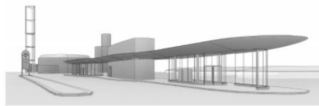
Street View 3D Perspective - View to the North