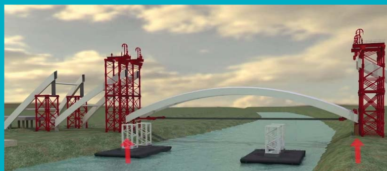
ARCH LIFT ANIMATION STILL

Arch steel will be assembled on site and lifted into place on top of the thrust blocks. The central segment of the arches will be assembled on the south side and moved along tracks before being transferred to barges on the river. Once on the barges, the central segments will be floated across the river until one side of the arch rests on each berm. Temporary lift towers installed on the berms will then lift the arches into place on top of the thrust blocks. An animated arch lift video is available at edmonton.ca/walterdalebridge