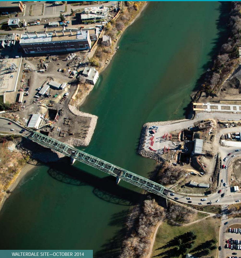
WALTERDALE SITE—OCTOBER 2014

Construction on the new $155 million Walterdale Bridge project began in January 2013. The new bridge will feature three northbound traffic lanes and enhanced pedestrian and cyclist crossings, with a walkway on the west side and a separated shared-use pathway on the east side. Roadway and trail links north and south of the river will also be enhanced.