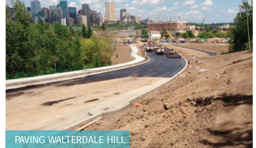
PAVING WALTERDALE HILL