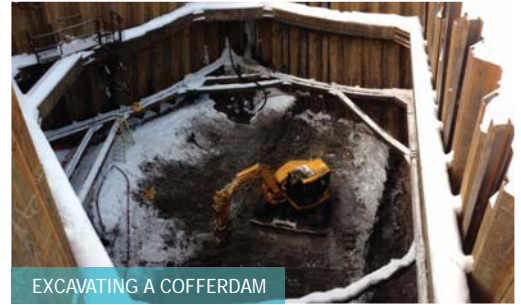
EXCAVATING A COFFERDAM