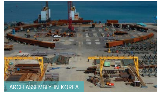
ARCH ASSEMBLY IN KOREA