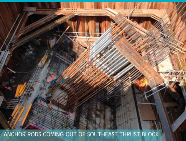
ANCHOR RODS COMING OUT OF SOUTHEAST THRUST BLOCK

Each completed thrust block will measure 10 m across with a volume of 600 cubic metres and be buried 20 m below the road surface.