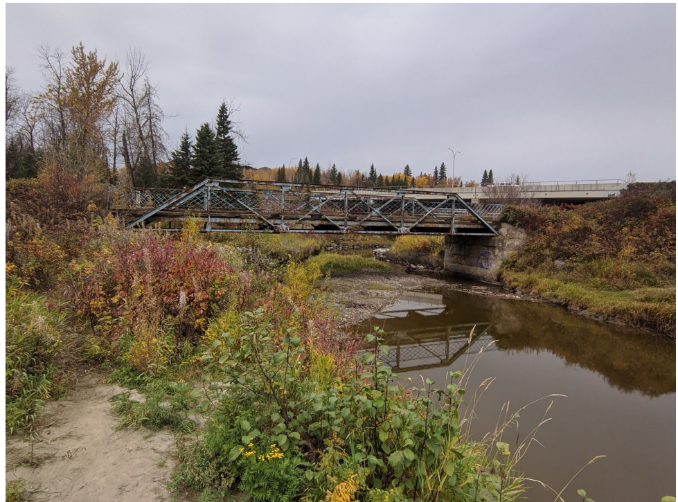
Existing Smith Crossing Pedestrian Bridge - looking west in fall 2020

A preliminary design of the bridge and site will be presented in late spring 2021 for review by the public. A 'What We Did' response to 'What We Heard' comments from this survey will be provided.