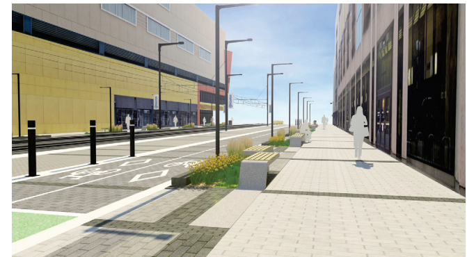
The Valley Line—102 Avenue streetscape will reflect design principles from the Capital City Downtown Plan, Quarters Public Realm Plan and Quarters Urban Design Plan.