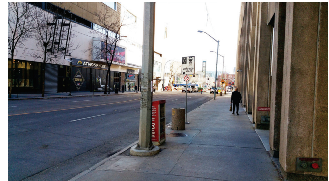
Current view of 102 Avenue (looking eastbound from 100A Street).