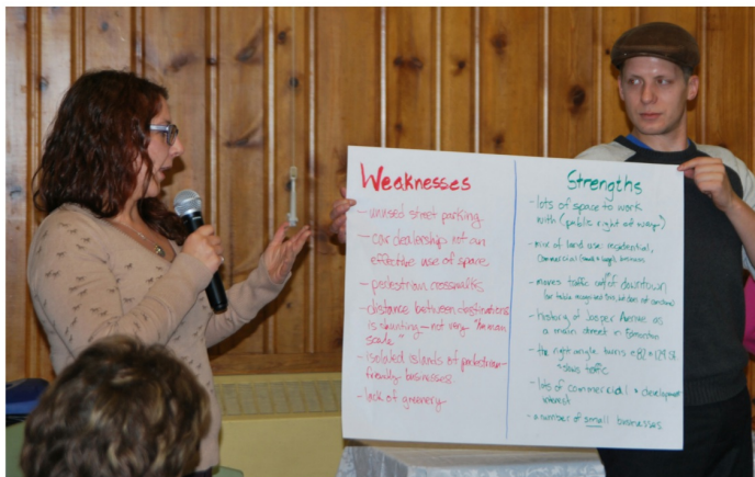
Residents present their group's Strengths, Weaknesses, Opportunities and Threat analysis of Jasper Avenue at the workshop on Nov. 25, 2015

Reinforce Jasper Avenue's local connections to the community, river valley, downtown and other destinations. Use the streetscape as a catalyst for higher quality development and urban form.