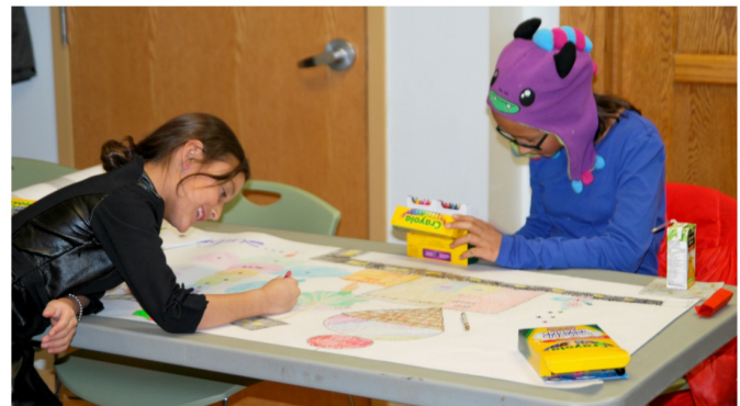
The kids' workshop on Nov. 25, 2015 had kids share their vision for Jasper Avenue through drawing and Lego. Places for pizza and ice cream were main themes.