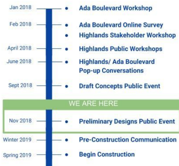
Highlands Public Engagement Timeline