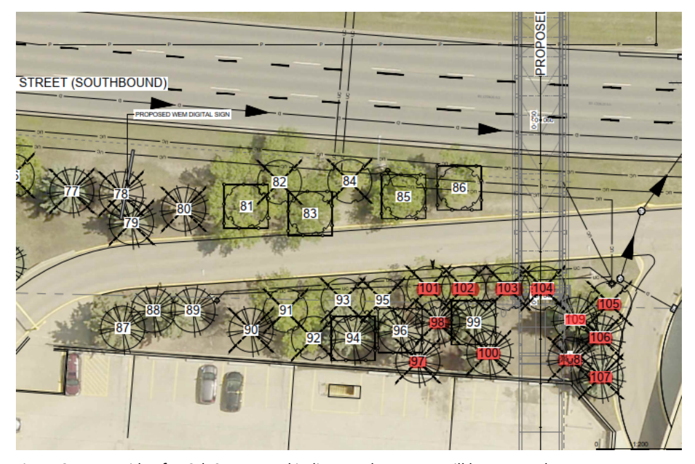
Figure 2 – West side of 170th Street - Red indicates where trees will be removed.