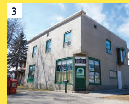
Tree Frog Corner