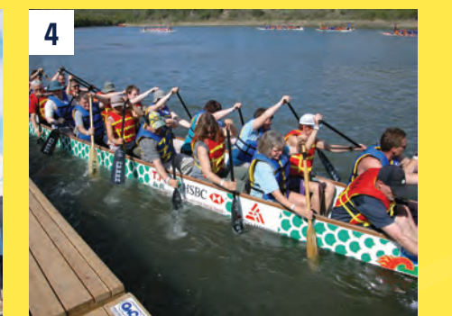
Dragon Boat Dock