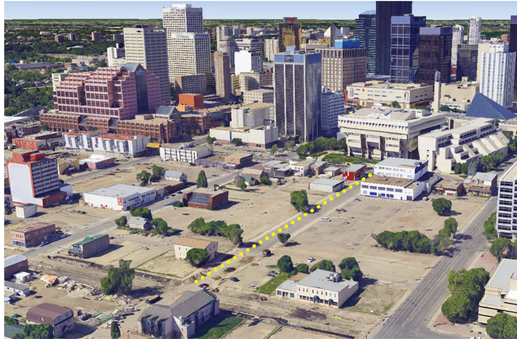
FUTURE LRT STATION