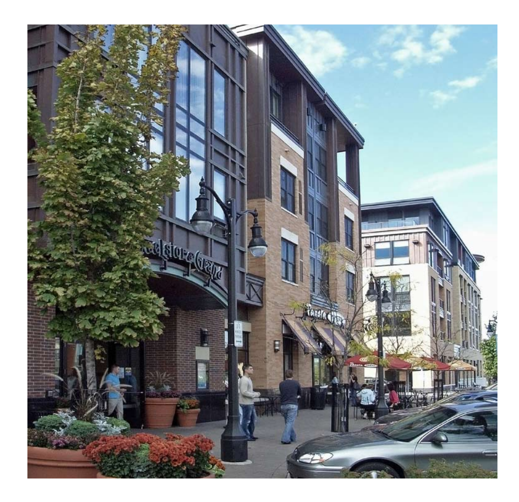
Development Opportunity Areas