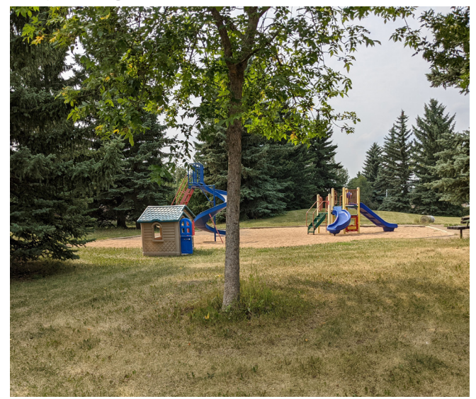
Play Equipment in 55 Street Park