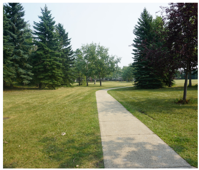
Walkway in Meyokumin Park