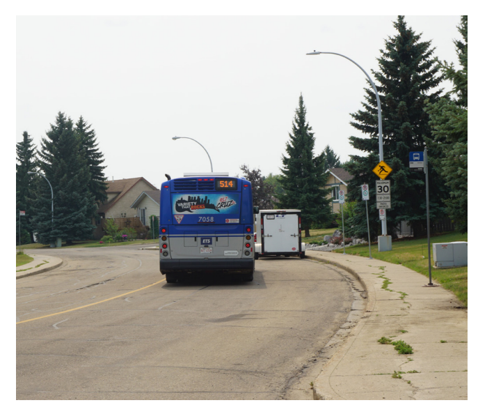
Bus Stop on 19A Avenue