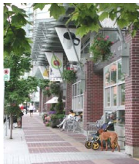
Figure 2 – Example of Commercial Retail Unit Active Frontage