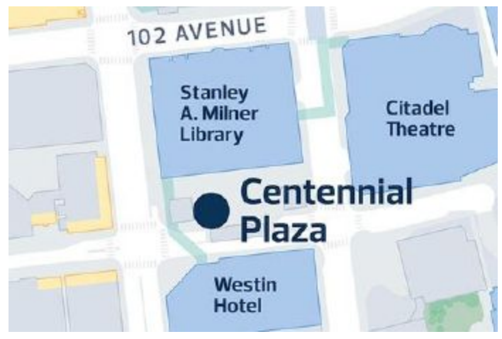
Figure 1: Location of Centennial Plaza

Centennial Plaza is located between Stanley A. Milner Library and the Westin Hotel and is a space that hosts library events, informal gatherings and public events. The City has been working on redeveloping this downtown open space to create a more attractive, welcoming and accessible place.