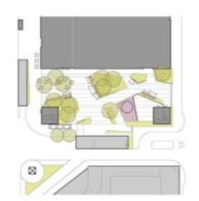
Option C The River Bluffs