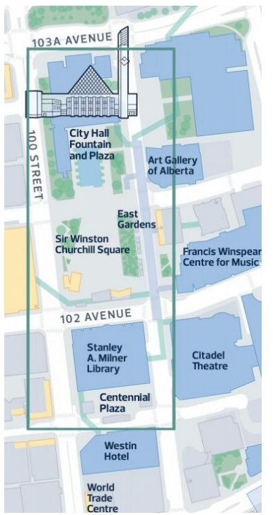
Figure 3: Civic Precinct Based on the feedback received, as well as CIty policies and other limitations and opportunities of the Plaza, four project goals and three

Public engagement for this project began in the fall of 2018, when the City considered child-friendly design options for the whole Civic Precinct (see figure below). The public feedback gathered in 2018 provided the foundation for further work on Centennial Plaza specifically.