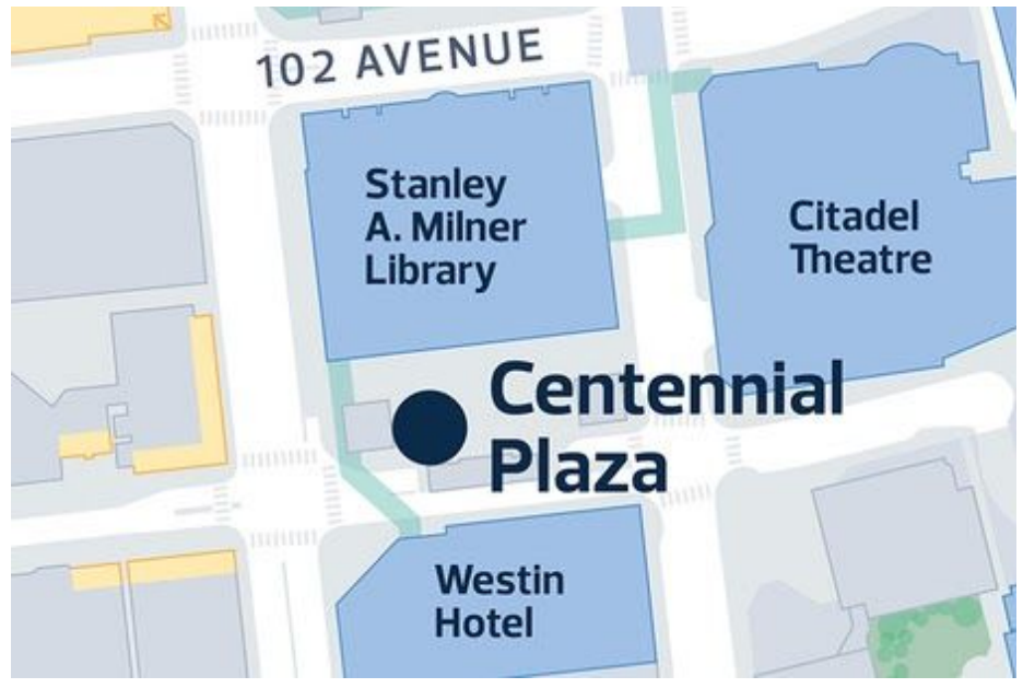
Figure 1: Location of Centennial Plaza

Centennial Plaza is located between Stanley A. Milner Library and the Westin Hotel and is a space that hosts library events, informal gatherings and public events. The City is planning to redevelop this open space downtown to create a more attractive, welcoming and accessible place.