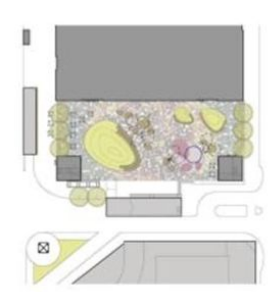
Option A The Living Skies