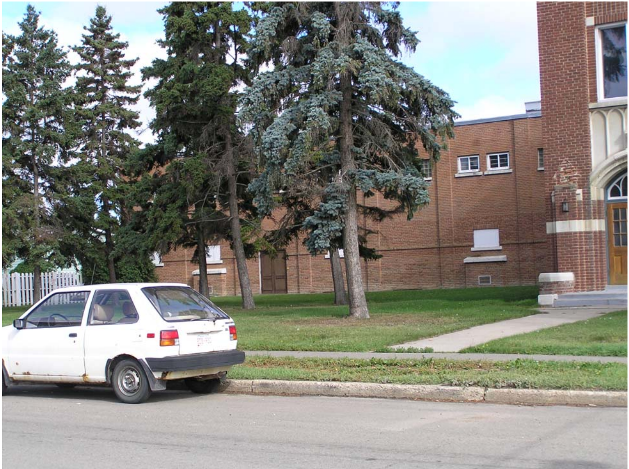
South Façade of 1946 gymnasium facing 129 Avenue