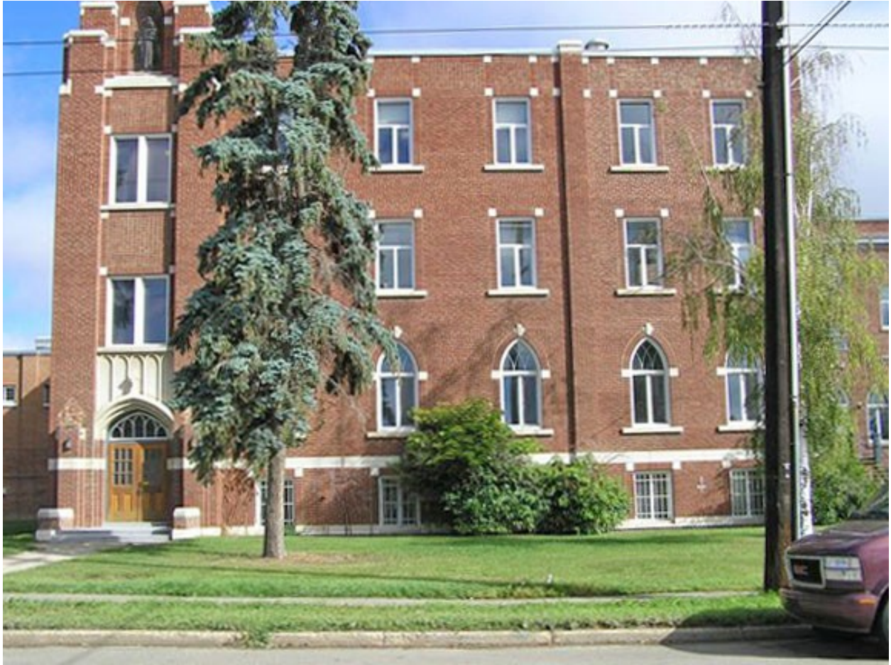
South Façade of 1931 building facing 129 Avenue