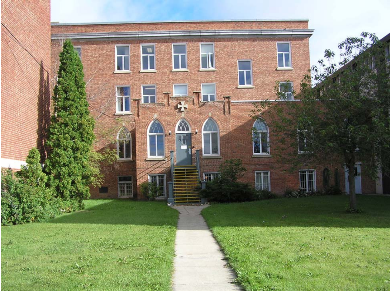
South Façade of 1925 building facing 129 Avenue