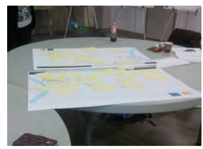
Theme testing activity using sample stories