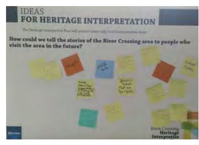
Examples of ideas shared during the Open House.