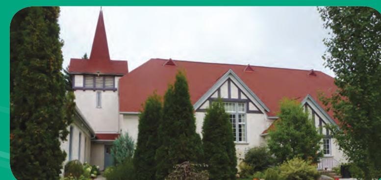
Parish of Christ Church Anglican (12116 – 102 Avenue)