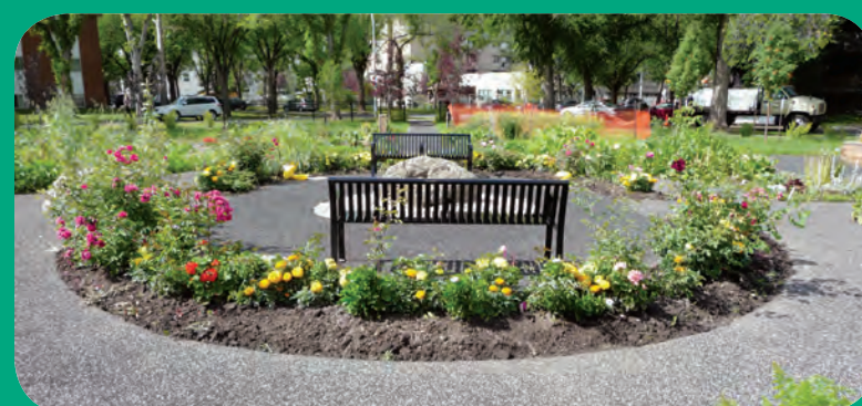
Peace Garden Park/Community Garden (10289 – 120 Street)