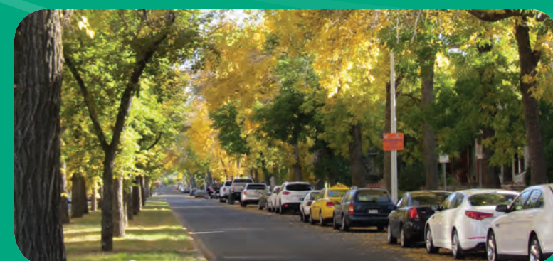
Tree-lined street (121 Street looking south)