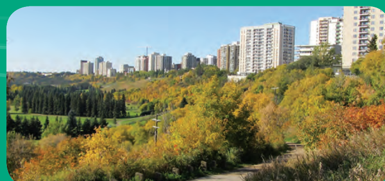
Oliver Skyline (looking west)