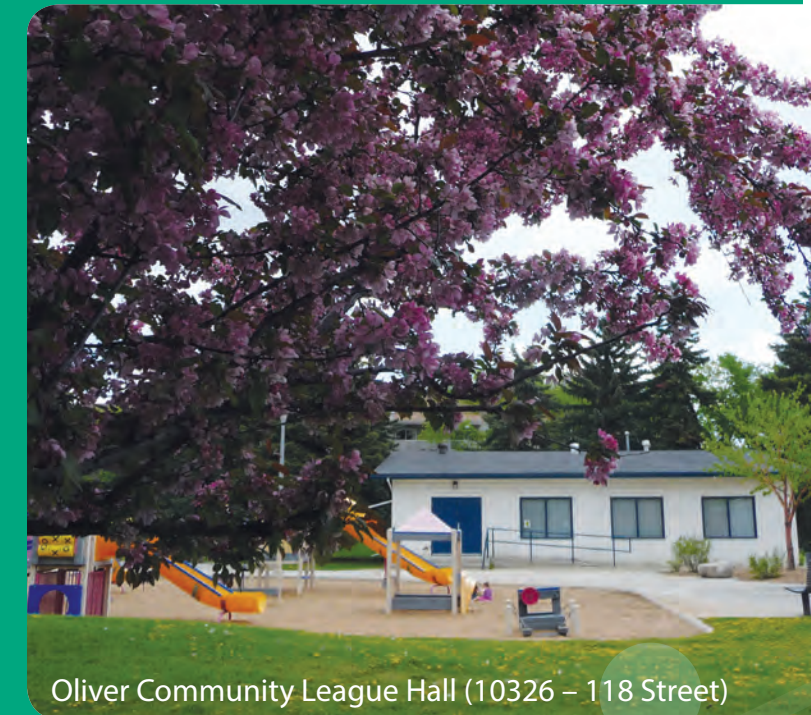
Oliver Community League Hall (10326 – 118 Street)