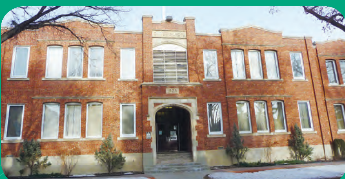
Oliver Elementary School/Nellie McClung Junior High (built 1910 – 11) 10227 – 118 Street