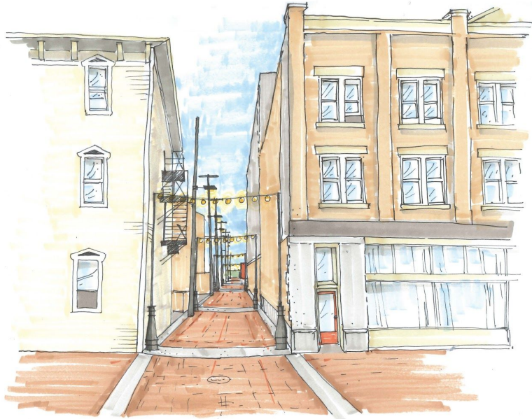
Alley entrance draft design, looking west from Gateway Boulevard