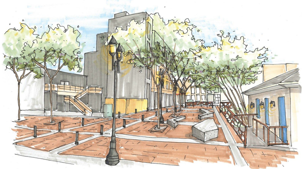
Plaza draft design, looking south from 83 Avenue