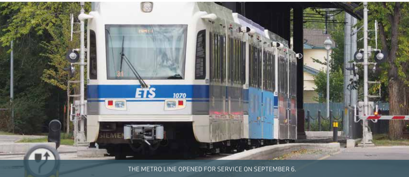
THE METRO LINE OPENED FOR SERVICE ON SEPTEMBER 6.