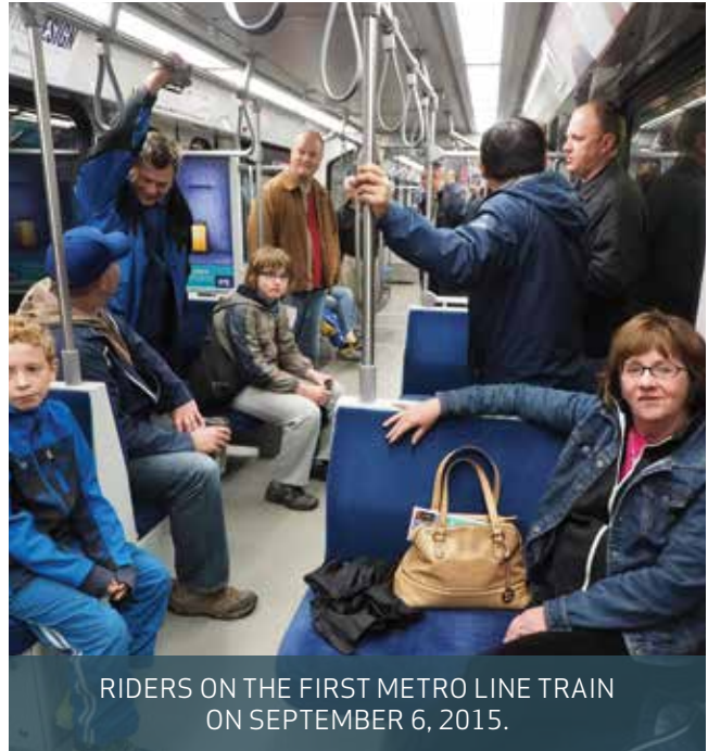
RIDERS ON THE FIRST METRO LINE TRAIN ON SEPTEMBER 6, 2015.