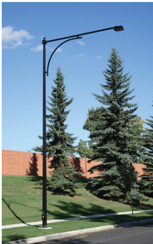
Inglewood (General)- Heritage arm decorative street light