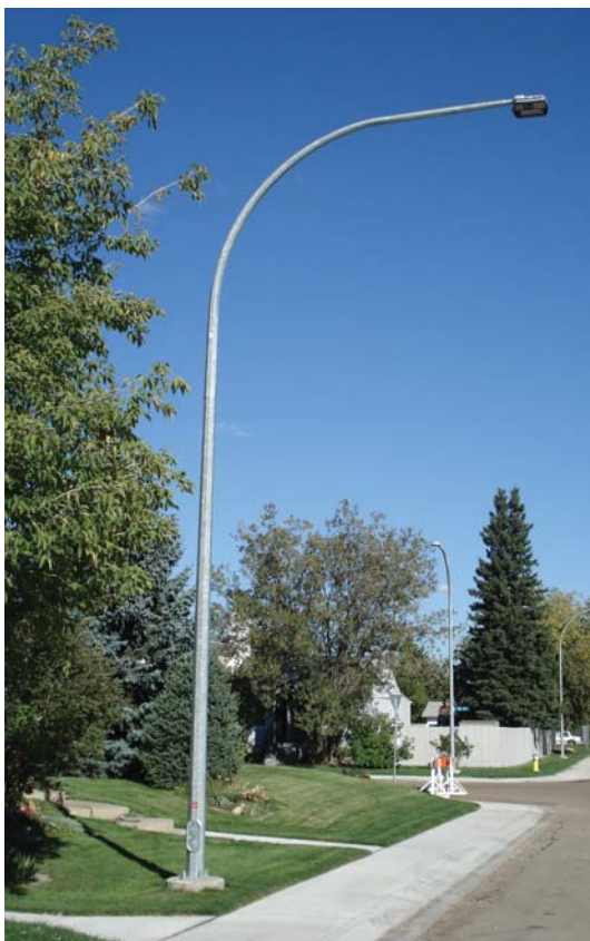
Standard galvanized street light