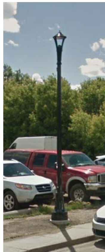
Area of Heritage Interest - Post top decorative street light with shroud