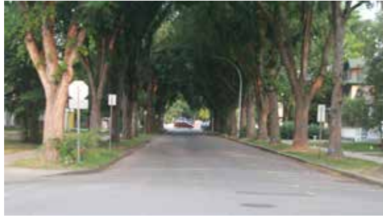
Residential: Areas where people live.