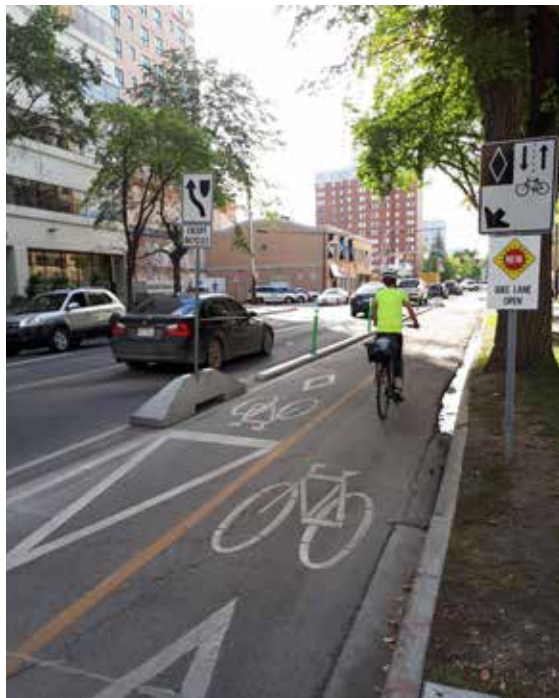
Figure 7 Example of protected on-street bike lanes