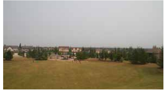
Community Destinations and Open Spaces: Areas that are visited by residents on a regular basis, like schools, district parks, recreation centres, hospitals, universities and colleges, and other major public and institutional uses.