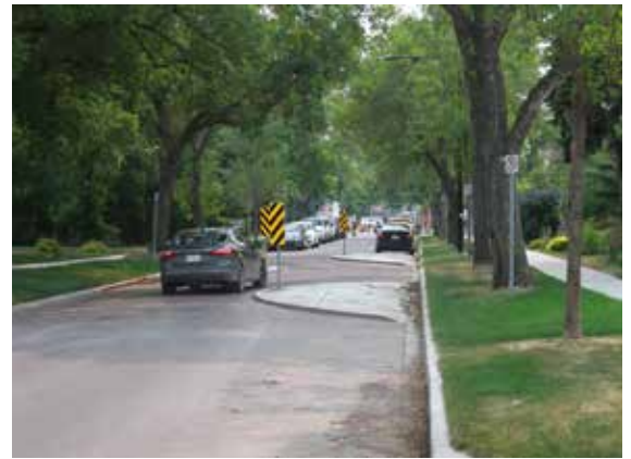
Figure 11 Chicanes, which are an example of a horizontal deflection.