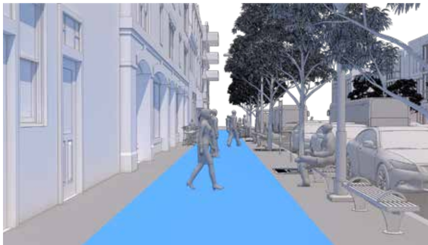
Figure 6 Pedestrian Zone