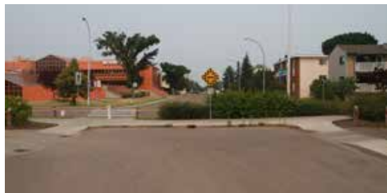
Figure 12 A full closure of a roadway, which is an example of an obstruction.