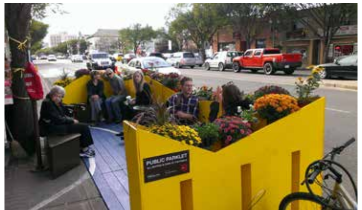
Figure 4 Ancillary zone uses – curb extensions and parklets (small scale public parks, seating areas, or sidewalk cafes)