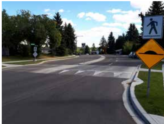
Figure 10 A raised crosswalk, which is an example of a vertical deflection.

Traffic calming uses a combination of mainly physical measures to reduce the negative effects of vehicle traffic for neighbourhood residents and road users. Traffic calming measures can encourage slower speeds, discourage shortcutting, and improve safety for people who drive, bike and walk.