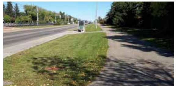
Figure 8 Example of a shared use path