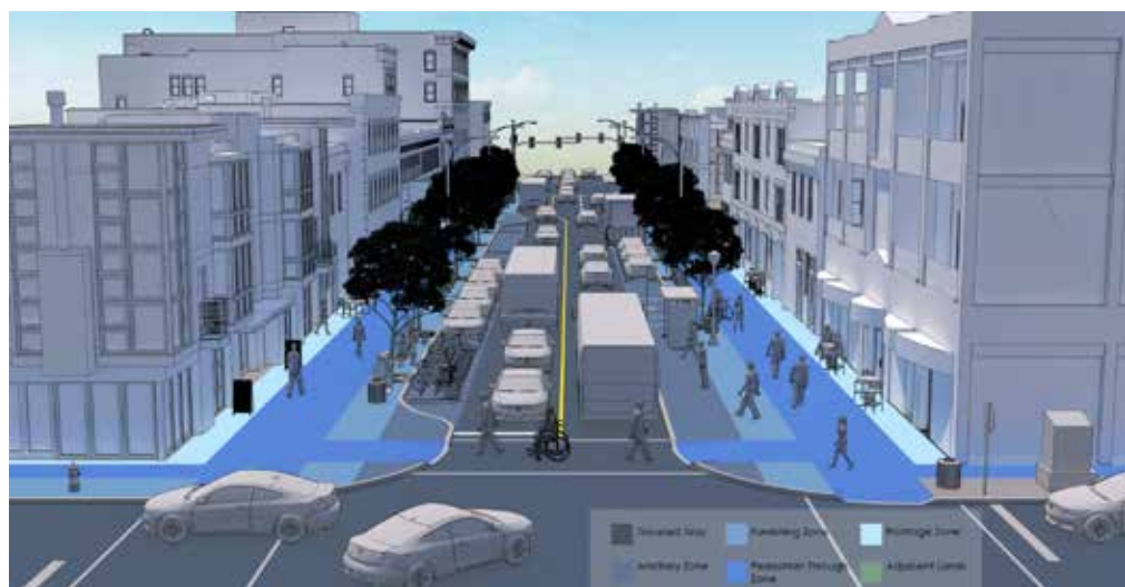
Figure 3 This picture shows the zones for a street oriented commercial road (or a Main Street).