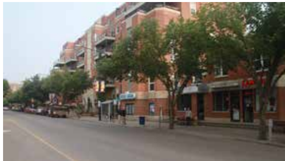
Commercial/Mixed Use: Areas with commercial and retail uses and places of employment ranging from main street-style retail areas, to downtown office towers, to shopping malls. Mixed use is achieved when these areas also have places of residence, which encourages people to live, work and socialize in the same area.