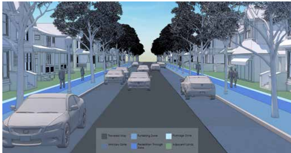
Figure 2 This picture is an example of zones for a residential local road.

In Edmonton, the area used for streets is divided into a series of design zones that include space for people who are driving, those who are walking or wheeling, and those who are biking. The zones apply to all streets, but elements in the design zones look different depending on the context.