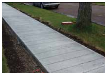
Figure 5 Whenever possible, the City designs and constructs in ways to make sure trees are protected. In some cases trade-offs need to be made which could include reducing the roadway width, sidewalk widths, or in rare cases, removing the tree.