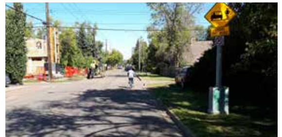
Figure 9 Example of a shared roadway

The City is developing the Edmonton Bike Plan, which is an update to the 2009 Bicycle Transportation Plan. The plan will provide strategic direction to grow the bike network and improve biking in Edmonton. ( edmonton.ca/bikeplan )