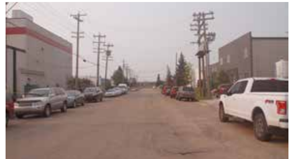
Industrial: Areas with warehouses, manufacturing establishments, and large industrial plants and that may include commercial functions. Transportation behaviour is unique from other employment areas due to truck access requirements and lack of residential uses.