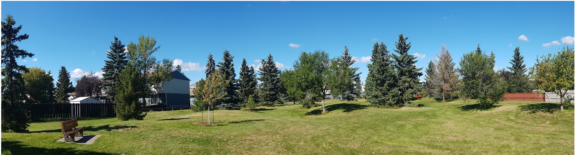
Harry Farmer Park

Baturyn has spaces to meet and connect with neighbours in all seasons.