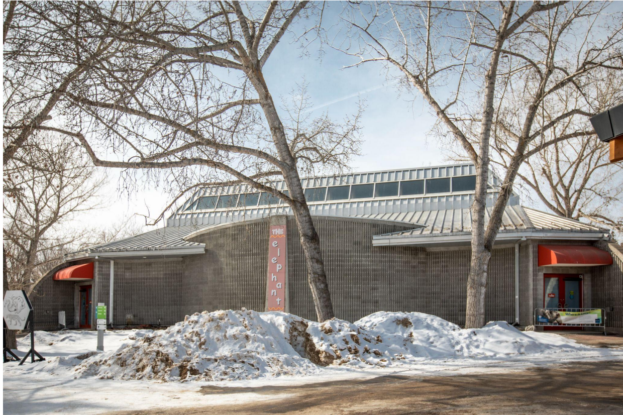
The elephant building is currently closed to the public.