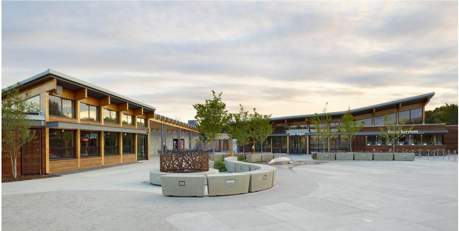
This is the Entry Plaza to the Edmonton Valley Zoo.