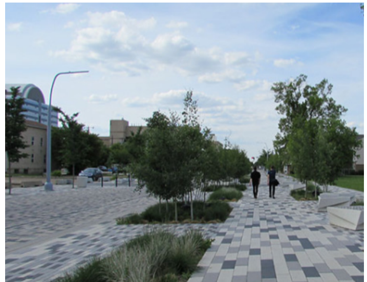
Pedestrian-oriented corridor along 96 Street

The information contained herein is believed to be true, but does not constitute a contract. Buyers should verify all information to their own satisfaction. Price, terms and conditions are subject to change within notice. GST is not included in price.