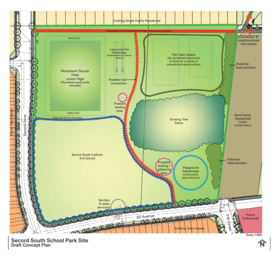
Figure Two: Draft concept plan presented through engagement