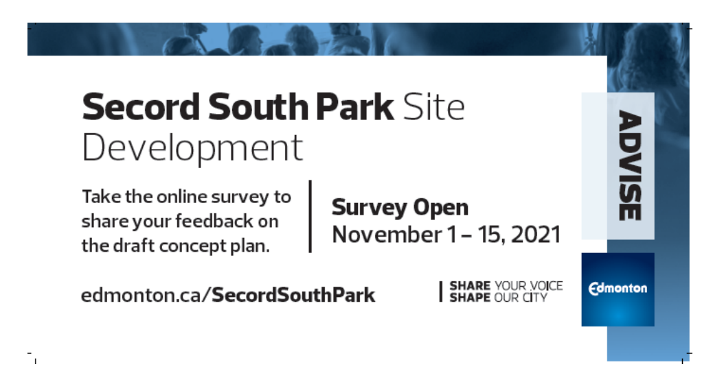
Figure Four: Roadside sign advertising the online survey