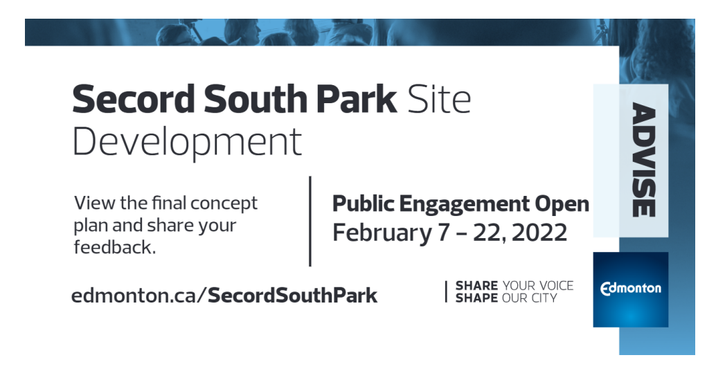
Figure Four: Roadside sign advertising the online survey