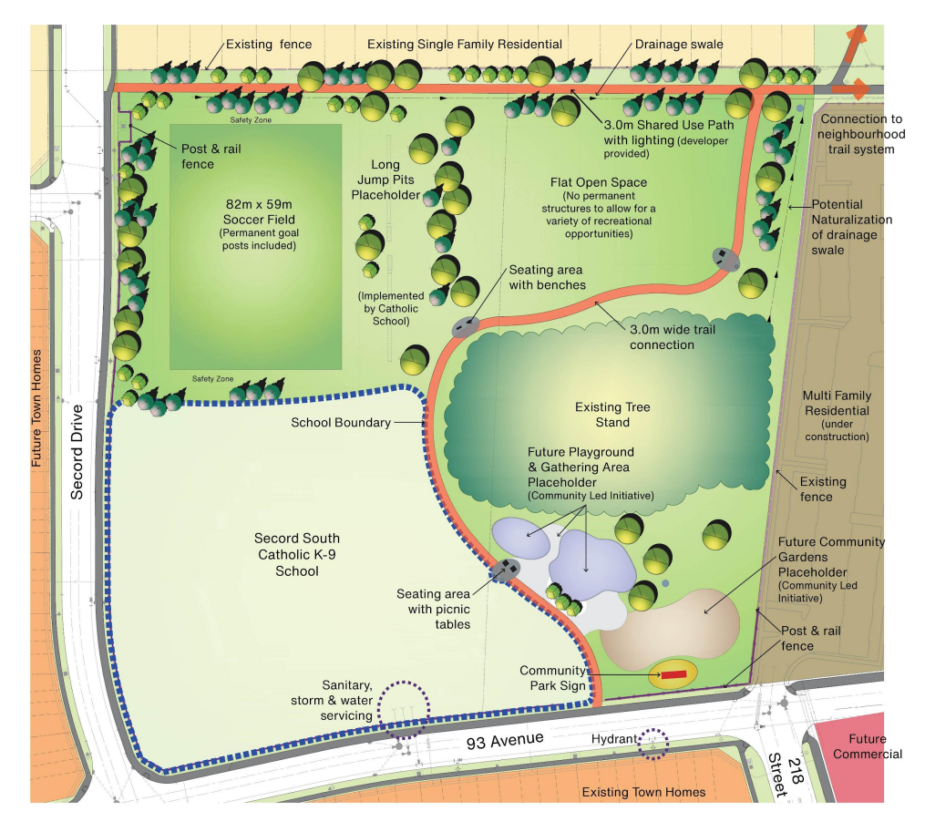
Figure Two: Final concept plan.

A significant amount of feedback continued to request a dog park, despite the rationale as to why it is not feasible for this site (as outlined in the What We Did Section of the first public engagement event, and above). Despite this park site not being a viable option for a dog park, the feedback from this survey has highlighted the demand for a dog park in this area of the city and the information will be shared with the Dogs In Open Spaces strategy team. The City of Edmonton's <u>Dogs in Open Spaces Strategy (2016)</u> outlines the direction and appropriate sites for off-leash dog parks.