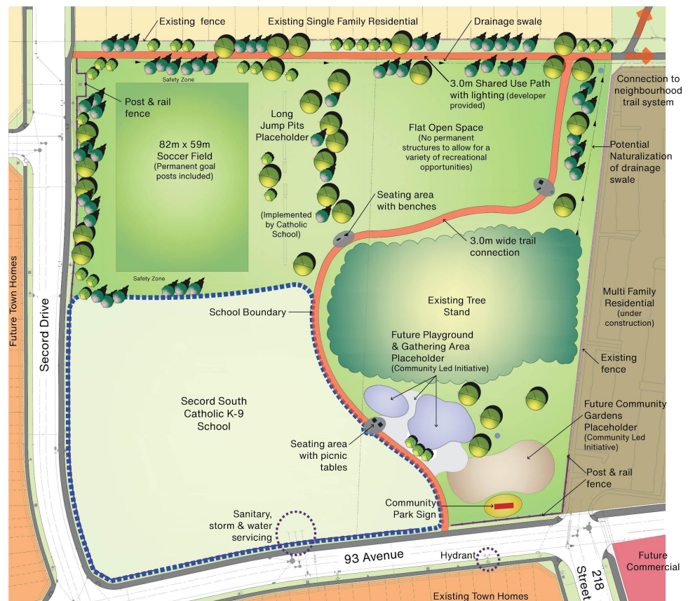
Figure Two: Final concept plan.

A significant amount of feedback continued to request a dog park, despite the rationale as to why it is not feasible for this site (as outlined in the What We Did Section of the first public engagement event, and above). Despite this park site not being a viable option for a dog park, the feedback from this survey has highlighted the demand for a dog park in this area of the city and the information will be shared with the Dogs In Open Spaces strategy team. The City of Edmonton's Dogs in Open Spaces Strategy (2016) outlines the direction and appropriate sites for off-leash dog parks.