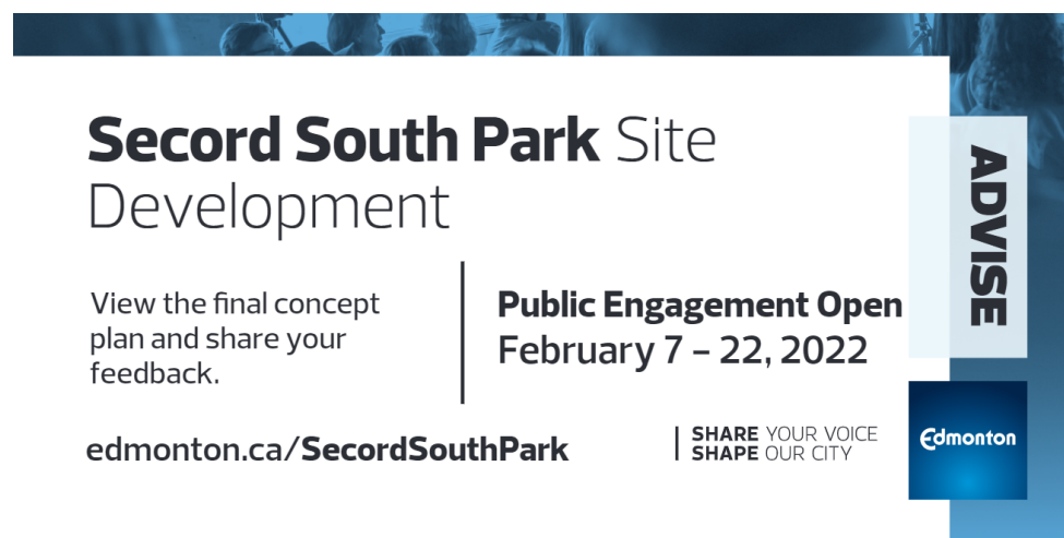
Figure Four: Roadside sign advertising the online survey