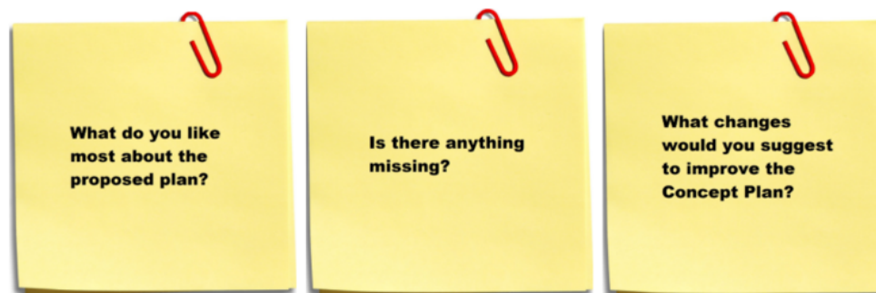
Image: The three questions participants were invited to respond to during the second public engagement event.

What do you like most about the proposed plans?