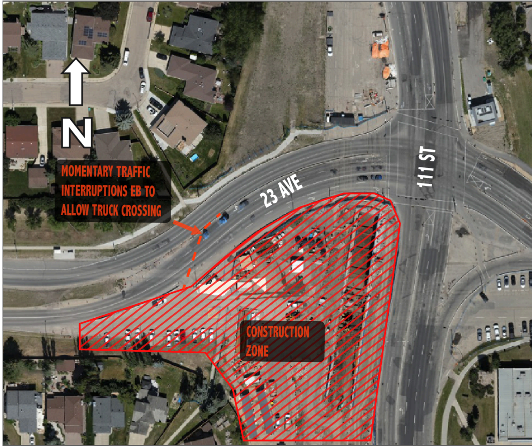
Photos: Progress on the LRT underpass at 111 Street and 23 Avenue