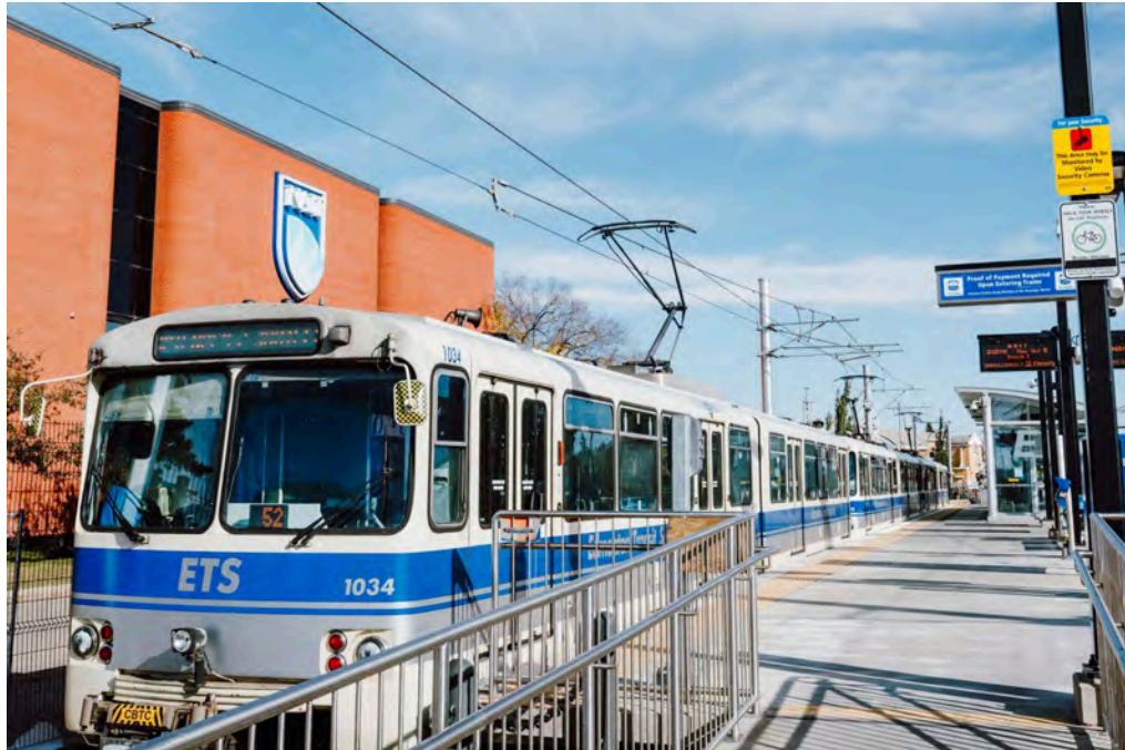
Former NAIT LRT Station

On March 18, 2024 , crews will begin demolishing the former NAIT LRT station. The project will salvage materials and parts that will be used for other ETS projects in the future. The demolition is anticipated to take two months and will include some weekend LRT service impacts in mid-April that could impact riders. Wayfinding and signage will be in place during this work to help riders navigate around the construction site. Throughout the demolition, the sidewalk on the east side of 109 Street will be closed (photo below).