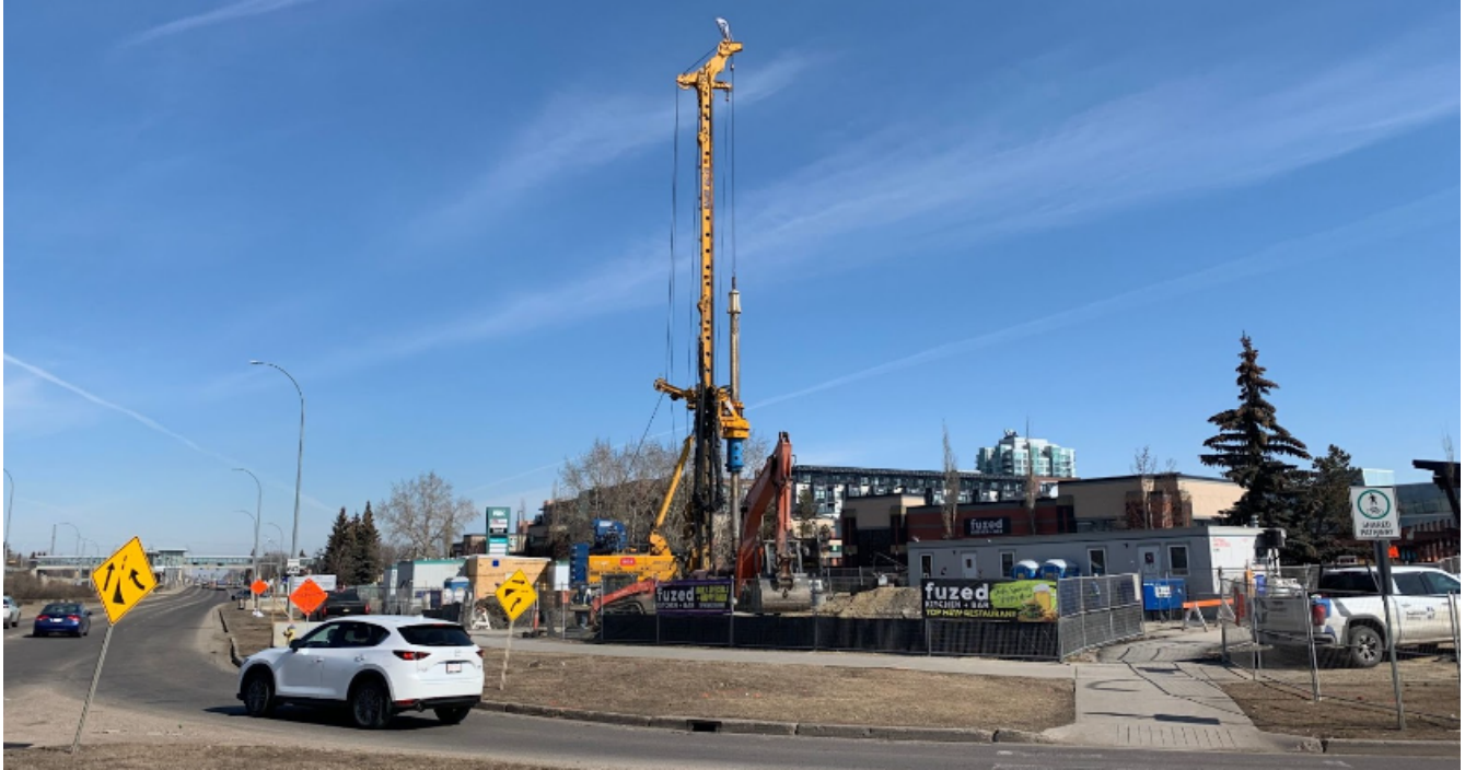
(northeast corner of 23 Avenue and 111 Street)