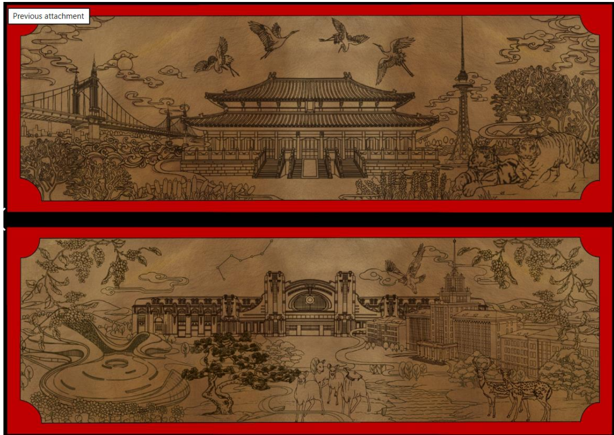
Draft of Art for South Facing Panels, Provided by City of Harbin