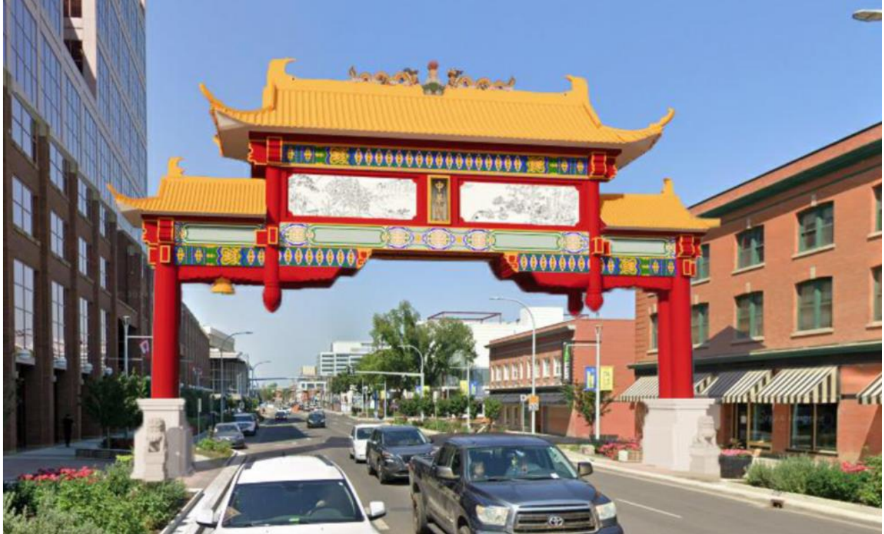
Rendering of New Gate, South Facing