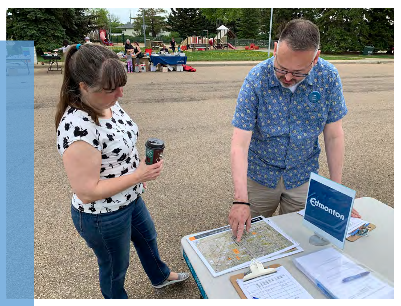
Balwin Community Garage Sale and Big Bin Event

The project team received a variety of perspectives during the mix of online/virtual and in-person public engagement activities implemented in the initial concept phase of this project. The team will be taking the information and direction provided by survey respondents and implementing it in the next phase of the concept design. Further public engagement opportunities will be provided in Fall 2022, to determine specific features for each of the five parks.