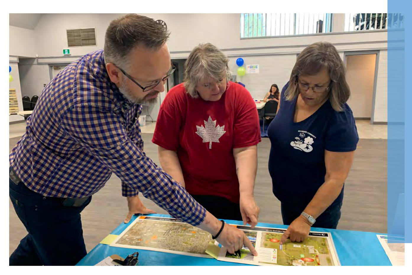
Belvedere Neighbour Day

Letter delivery, door knocking and in-person surveys focused on providing information and collecting survey responses from residents immediately adjacent to park sites and park users.