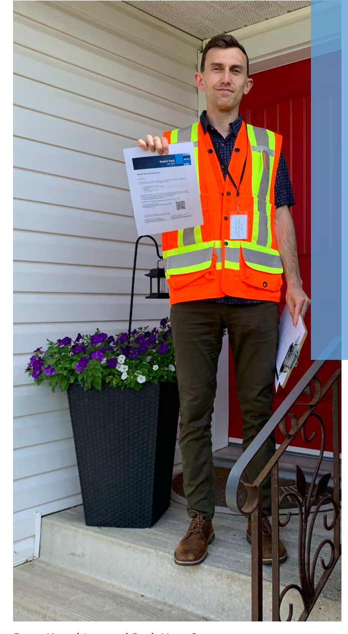
Door Knocking and Park User Surveys

A snapshot of the engagement activities the project team undertook is summarized in the following table.